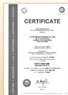
TS 16949 Accreditation